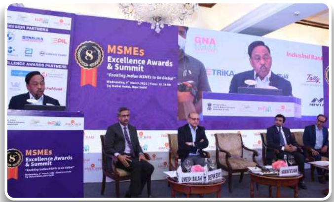
Shri Narayan Tatu Rane , Hon'ble Union Minister of MSME Government of India Addressing at 8th MSME Excellence Awards 2022