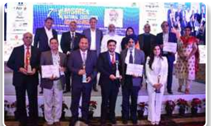
Winners group photo with Shri Pratap Chandra Sarangi , former Minister of State in the Government of India for Animal Husbandry, Dairying and Fisheries and Micro, Small and Medium Enterprises, Government of India at 7th MSME Excellence Awards