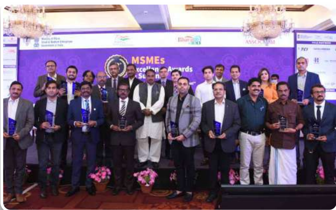
Winners Group Photo with Shri Bhanu Pratap Singh Verma , Hon'ble Minister of State MSME Government of India at 8th MSME Excellence Awards 2022