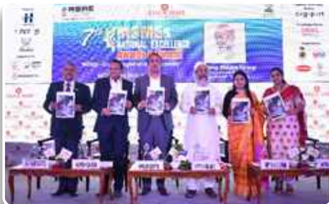
Shri Pratap Chandra Sarangi , former Minister of State in the Government of India for Animal Husbandry, Dairying and Fisheries and Micro, Small and Medium Enterprises, Government of India at 7th MSME Excellence Awards