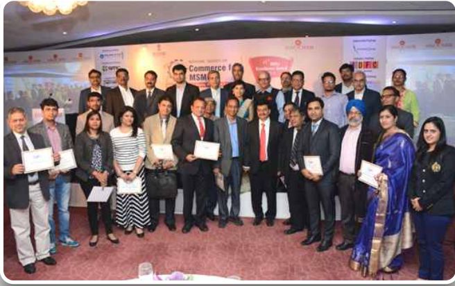
Winners group photo with Shri Haribhai Parathibhai Chaudhary , Former Minister of State for MSME, Government at 4th MSME Excellence Awards: 2016