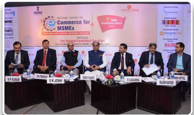
Shri Haribhai Parathibhai Chaudhary , Former Minister of State for MSME, Government at 4th MSME Excellence Awards: 2016