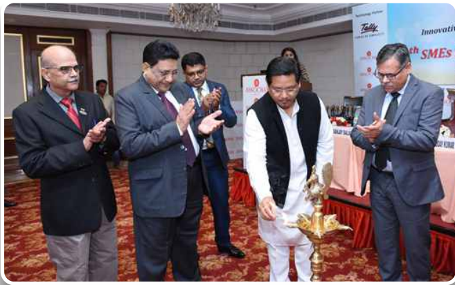
Hon'ble Chief Minister of Meghalaya Shri Conrad K Sangma at ASSOCHAM 6th MSME Excellence Awards: 2019