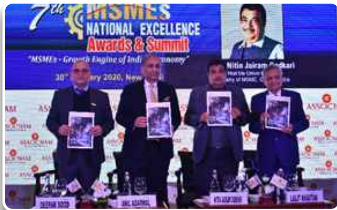
Shri Nitin Jairam Gadkari Minister for Road Transport & Highways (former Union Minister Minister of MSME), Government of India at 7th MSME Excellence Awards