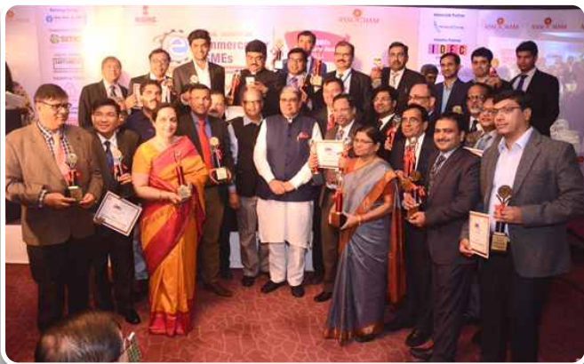
Winners group photo with Shri Haribhai Parathibhai Chaudhary , Former Minister of State for MSME, Government at 4th MSME Excellence Awards: 2016