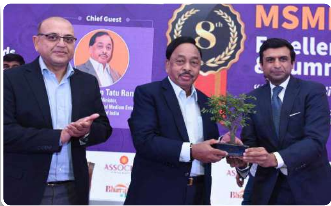
Shri Vineet Aggarwal , President ASSOCHAM facilitating Shri Narayan Tatu Rane Hon'ble Union Minister of MSME Government of India at 8th MSME Excellence Awards 2022