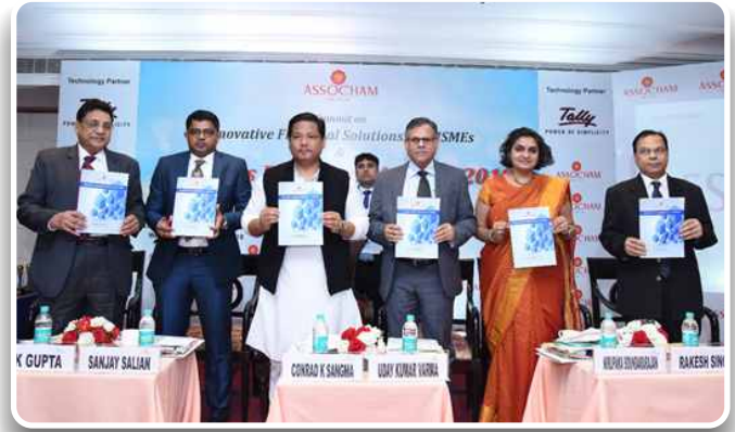
Hon'ble Chief Minister of Meghalaya Shri Conrad K Sangma at ASSOCHAM 6th MSME Excellence Awards: 2019