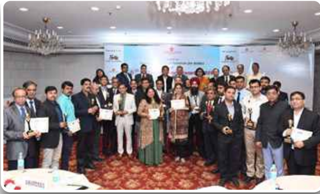
Winners group photo with Hon'ble Chief Minister of Meghalaya Shri Conrad K Sangma at ASSOCHAM 6th MSME Excellence Awards: 2019