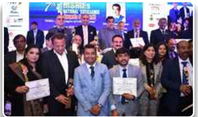
Winners Group Photo with Shri Nitin Jairam Gadkari , Minister for Road Transport & Highways (former Union Minister Minister of MSME), Government of India at 7th MSME Excellence Awards