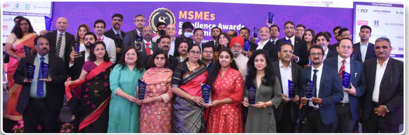
Winners Group Photo with Shri Narayan Tatu Rane Hon'ble Union Minister of MSME Government of India at 8th MSME Excellence Awards 2022