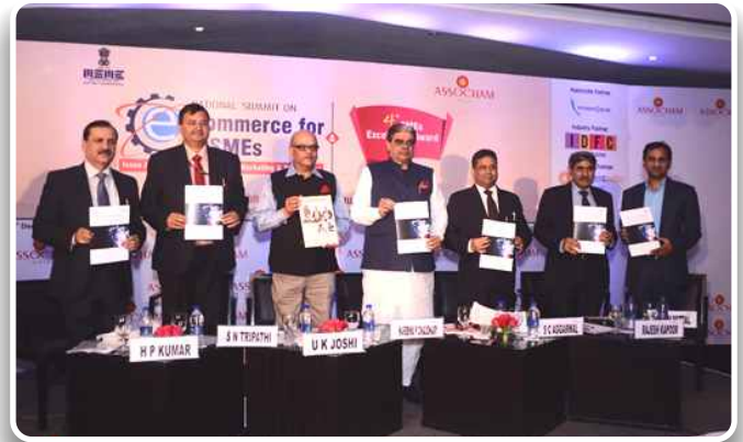
Shri Haribhai Parathibhai Chaudhary , Former Minister of State for MSME, Government at 4th MSME Excellence Awards: 2016